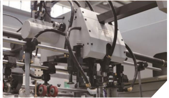
Taiwan OEM feeder

Taiwan OEM Gearbox, Ensure minimum space between the Input and output of drive from gearbox in order to maintain Gripper accuracy.